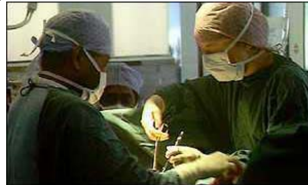
Heart operations at the Bristol Royal Infirmary